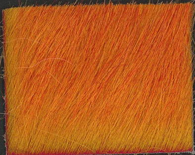
ORANGE / MELON