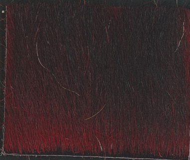
RED / BLACK