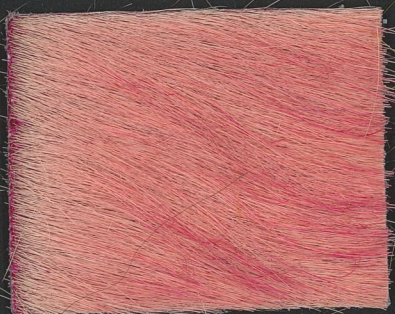
WHITE / PINK