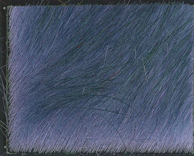
LAVANDER / VIOLET