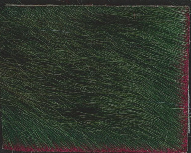
GREEN / RED