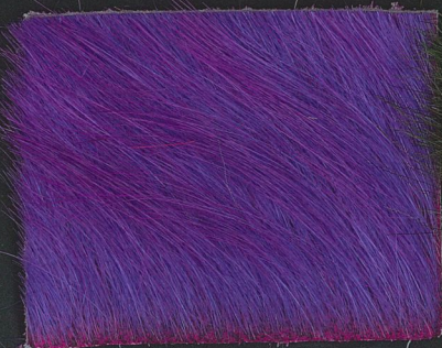
LAVANDER / FUXIA