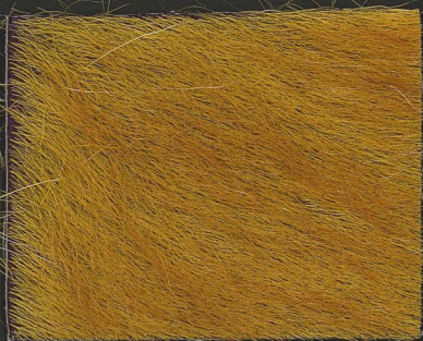
YELLOW / FUXIA